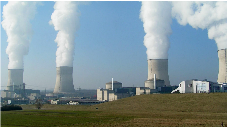
Figure 2: A nuclear power plant in Cattenom, France. France's nuclear energy accounts for 76.3% of its total electricity production. The stacks rising out of the four large towers in this image are made of steam and are harmless.

when it comes to nuclear has scared the public and policymakers away from a potentially planet-saving energy source. 19 But the merits that nuclear has over its alternatives, coupled with the pressing threat of climate change, make it more than worthwhile to reconsider our attitudes towards nuclear energy.